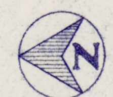
LOWER FLOOR PLAN